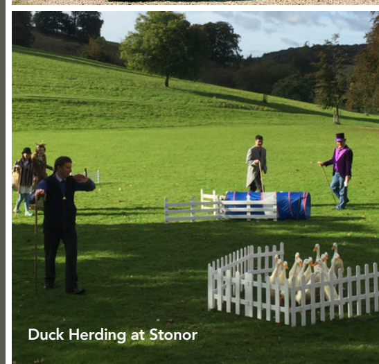
Duck Herding at Stonor