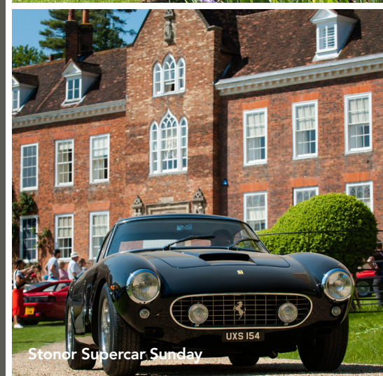
Stonor Supercar Sunday