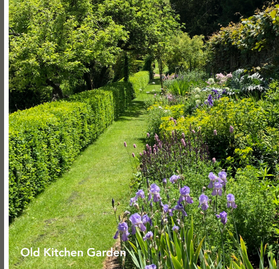
Old Kitchen Garden

For prices and more information on all specialist activity please contact us directly.